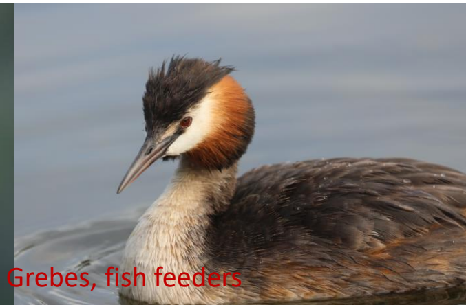
Auks, Grebes, fish feeders