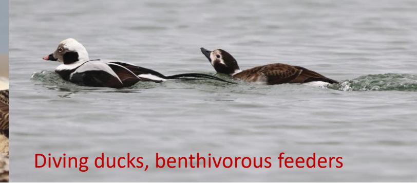
Diving ducks, benthivorous feeders