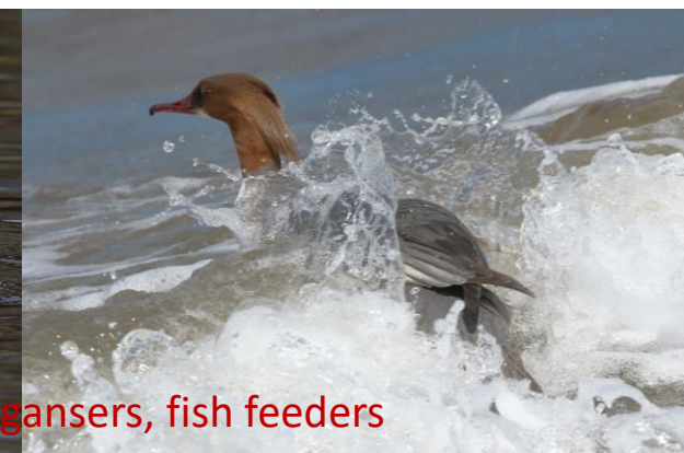
Divers, Mergansers, fish feeders